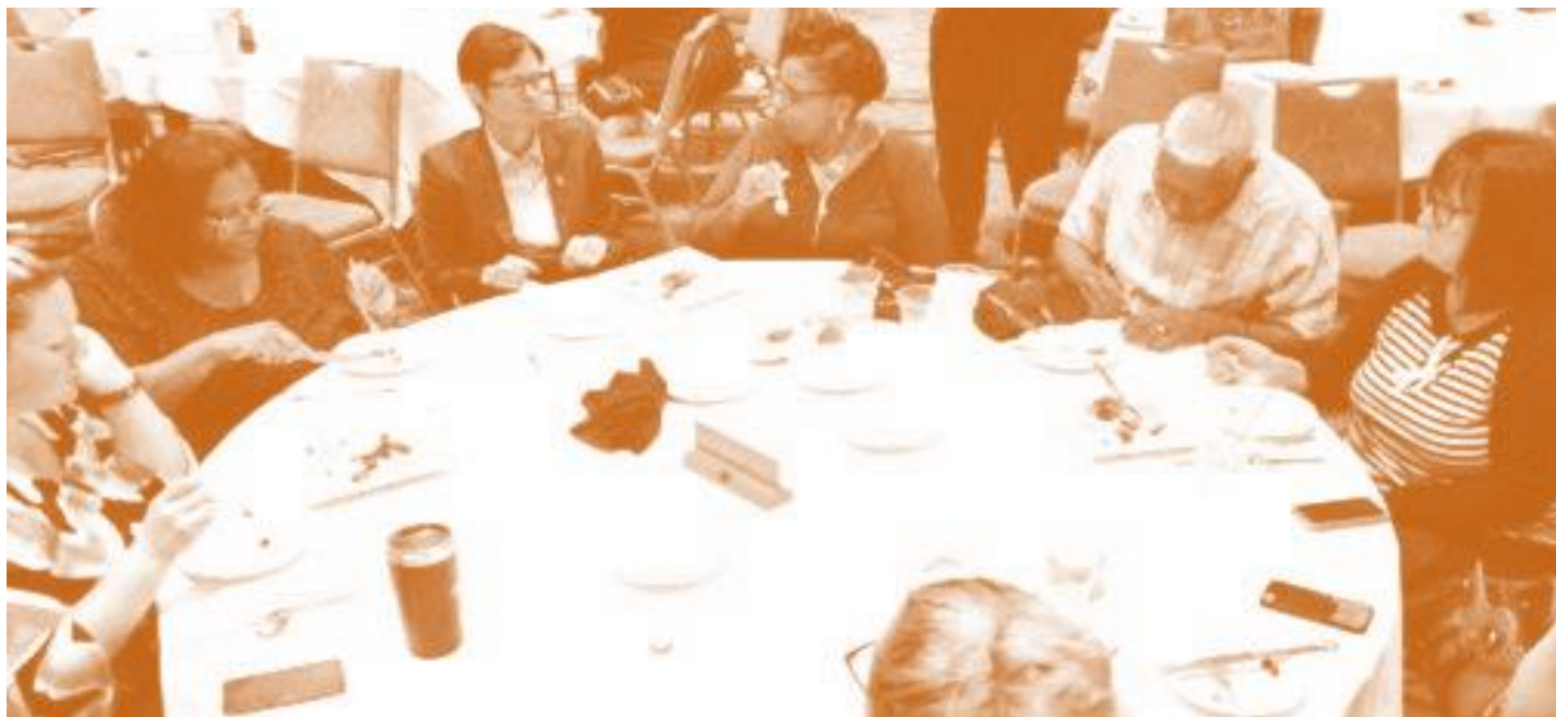
Enjoying good food and fellowship at the banquet on Thursday night.

Having SC ANFP join us again was special and NC ANFP is looking forward to more joint conferences with them. The Fall Conference of 2019 is already set in Myrtle Beach again at the Oceanfront Double Tree Hotel. Start saving now so you can attend.