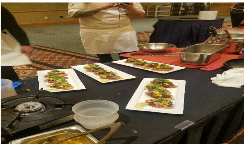
One of SC ANFP Chefs' presentations looked great and very edible!

Competition was strong, serious and fun! We didn't know we had so many chefs among us. The Chefs of Harrah's were all there mentoring while the audience was cheering for their respective Chapters. There was such an interesting array of ingredients to choose from and the judges had some attractive and palatable dishes to taste and judge. It was an entertaining and educational session. The SC Chapter Chefs "threw down the gauntlet" for NC! Those NC Chefs got down to serious business!