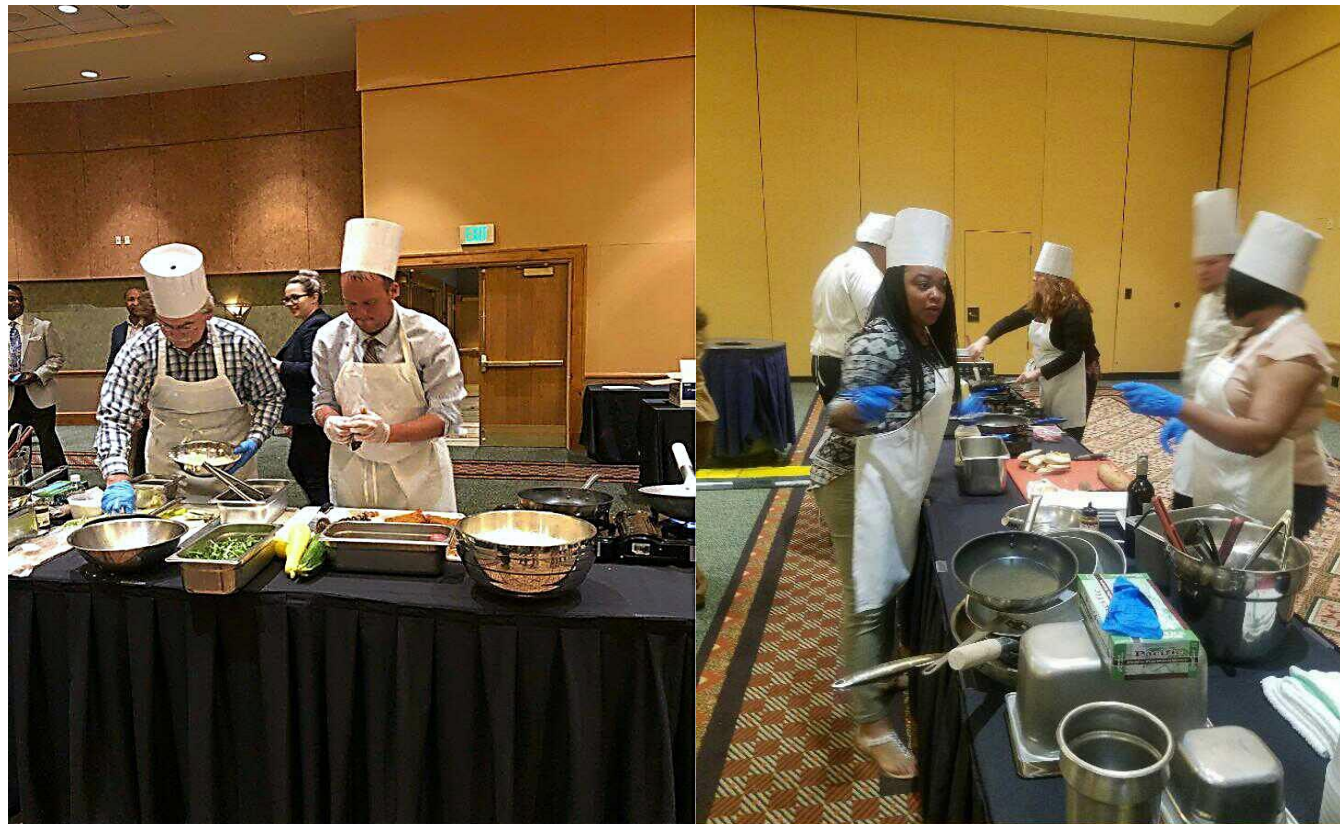
More chefs busily working on their presentations. NC ANFP's team of Chefs prepared a four course meal.

Having SC ANFP join us again was special and NC ANFP is looking forward to more joint conferences with them. The Fall Conference of 2019 is already set in Myrtle Beach again at the Oceanfront Double Tree Hotel. Start saving now so you can attend.