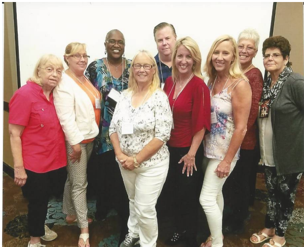
District 4 - Gulf Trails