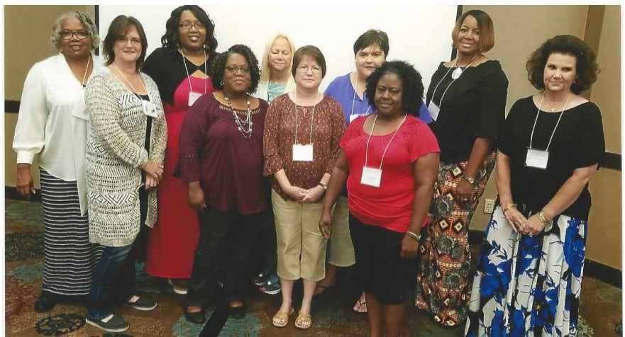
District 6—Panhandle & District 7- Capitol