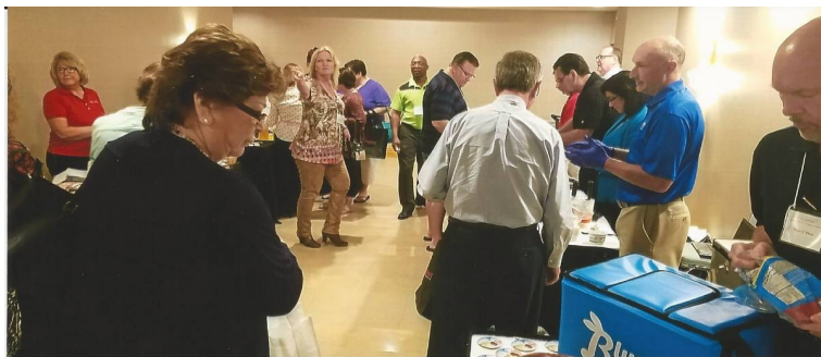
Members networking with the Vendors