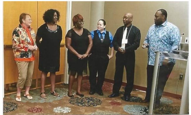
2017 Executive Board