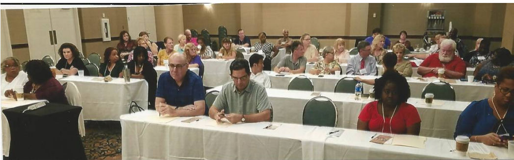
TOP: Members attending a 2017 Fall educational session BOTTOM: members getting motivated

The Theme for the Spring will be REJUVENATION w/ FI/ANF