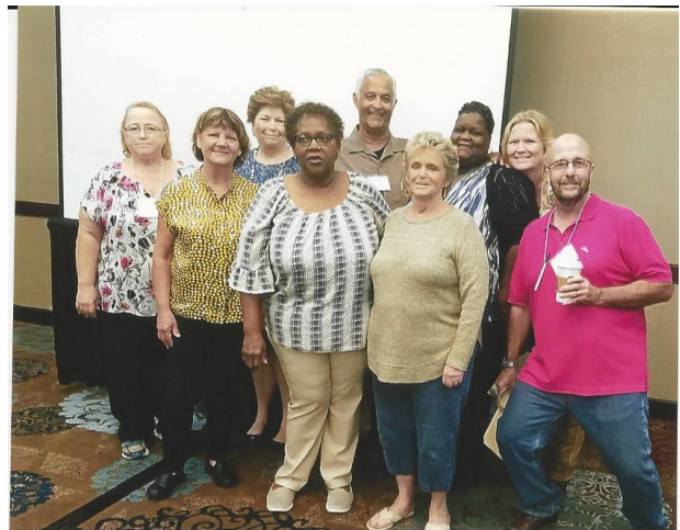
District 5—Gulf Central