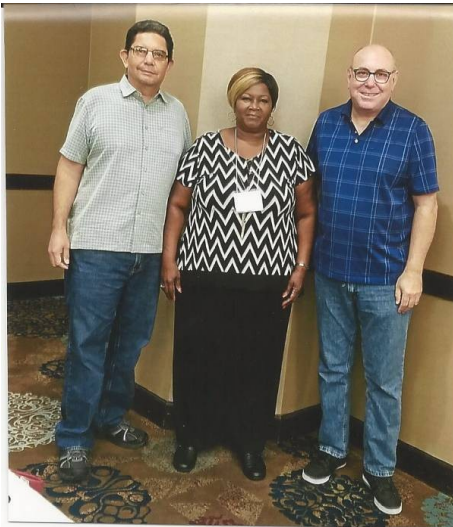
District 1 - Tri County