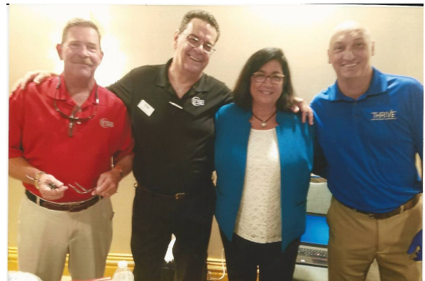
Gordon foods, Thrive, and FSE foods