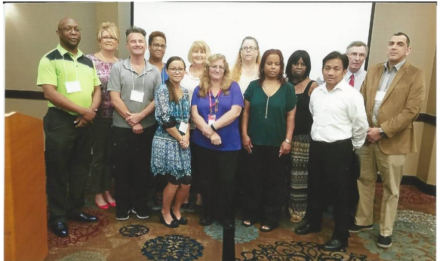
District 2 - First Coast