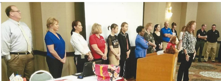
Vendors giving 3 min. presentation