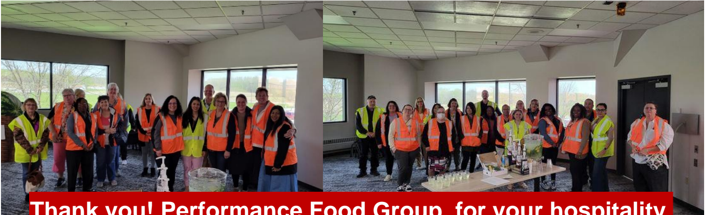
Thank you! Performance Food Group, for your hospitality while hosting our meeting, and a tour of your operations!